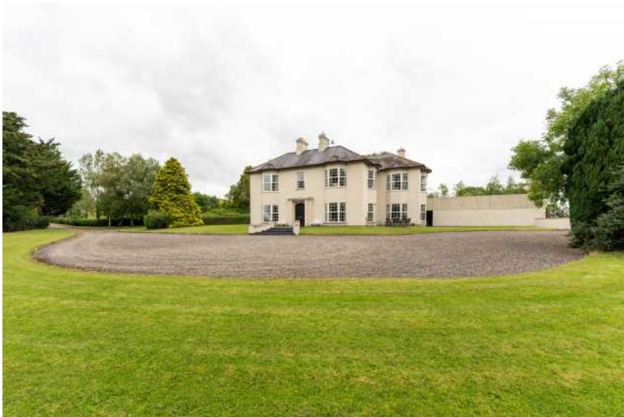
SUBSTANTIAL TWO STOREY RESIDENCE ON CIRCA 5 ACRES ‘OPTION OF ADDITIONAL LAND IF REQUIRED’